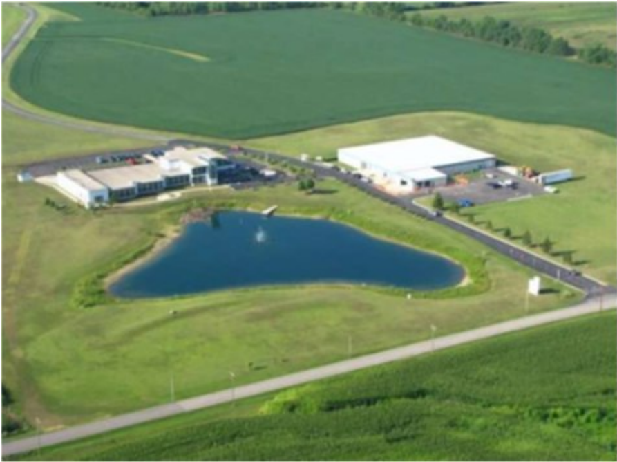
Entrance to the International Aeromodeling Center.